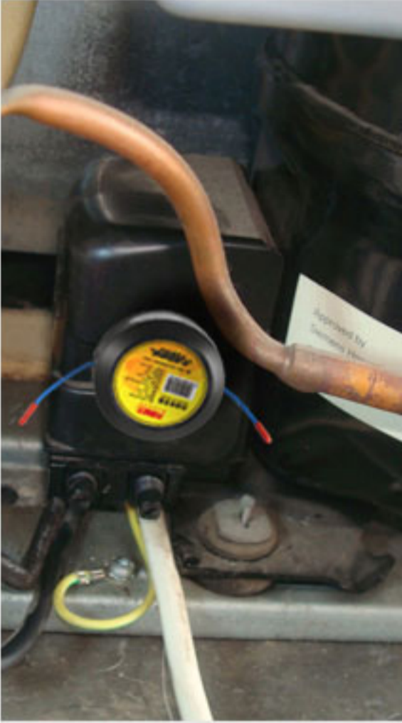
Refrigerator rear shell space

Multiple usage scenarios, fast 6-second fire extinguishing in enclosed spaces