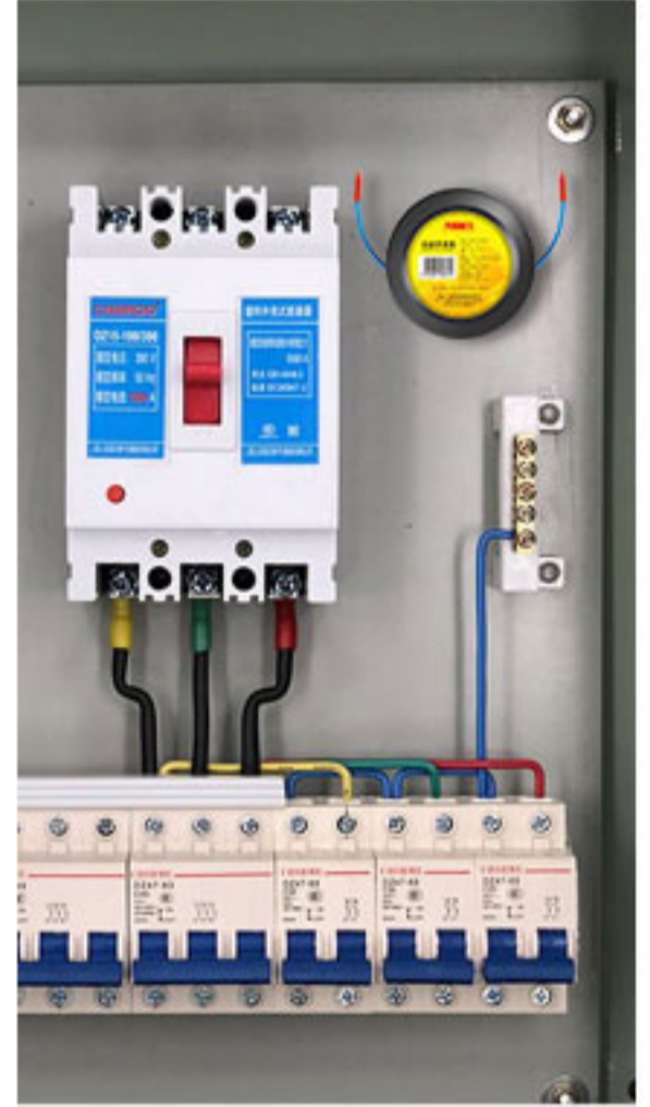
Electric switch box