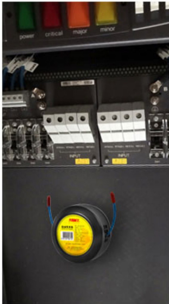
Communication room cabinet